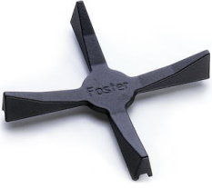
Cast iron wok support